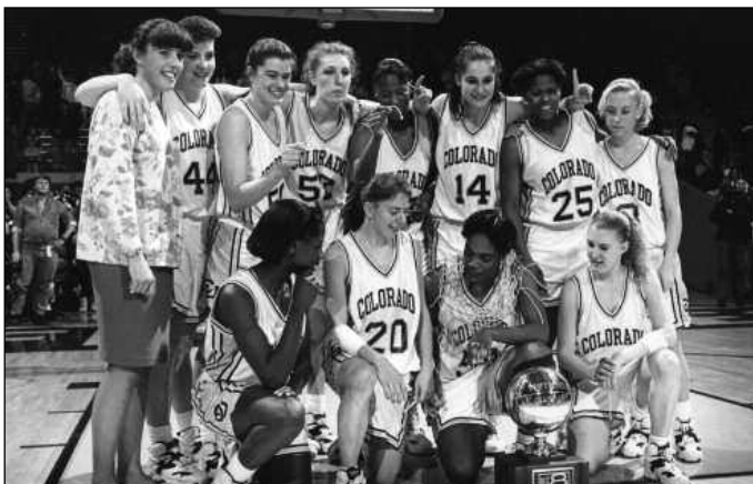
1994 Big Eight Champions (12-2)