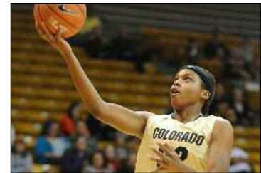
Brittany Spears 2011