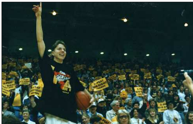
1995 Big Eight Champions (14-0)

A team little known to anyone outside the conference circles, the Buffs would take the nation by storm as they took a pre-season No. 25 ranking to No. 9 by March. A 15-game win streak to open the season would turn heads as CU was the country's seventh-ranked team when it opened the Big Eight campaign—a convincing 61-33 win over Kansas State in Boulder. The Buffs would live up to their preseason expectations to take the conference title, although few probably thought they would do it so convincingly, outscoring their league opponents by an average of more than 15 points a game.